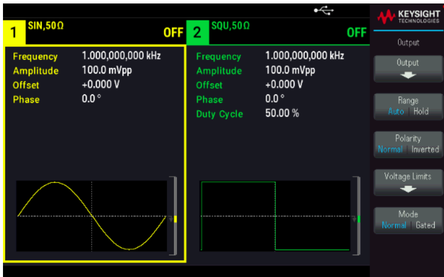
Figure 2. Dual-screen display of standard sine and square wave