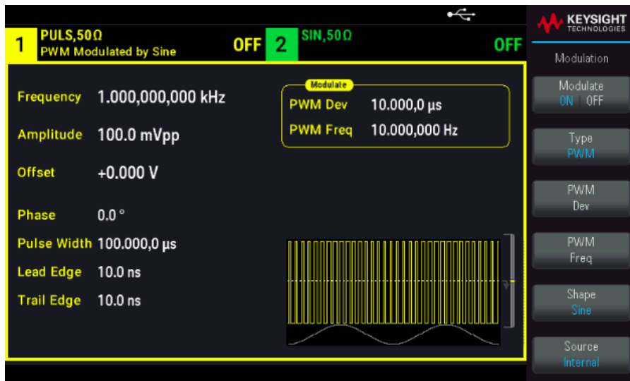
Figure 3. PWM modulated with standard sine wave