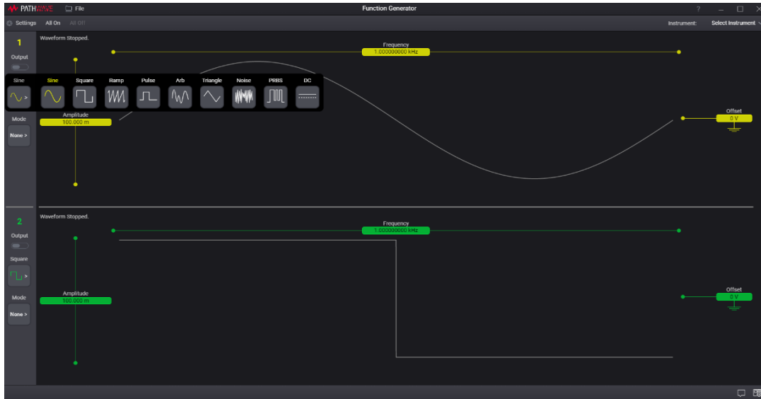
Figure 5. Select and configure your required waveform